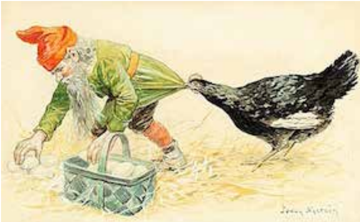
The Swedish Tomte mother Jenny Nyström's representation of an egg-thieving (and very colorful) Tomte.

A nisse (usually Norwegian) and a tomte (usually Swedish) are similar characters. They are both solitary, mischievous domestic sprites responsible for the protection and welfare of the farmstead and its buildings. Tomte literally means “homestead man” and is derived from the word tomt which means homestead or building lot. Nisse is derived from the name Nils which is the Scandinavian form of Nicholas.